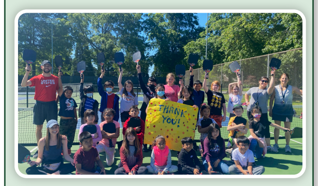
Students learn how to play pickleball during the June Imagine the Possibilities summer program at Jefferson Elementary

With the last session beginning early August, we hope to continue with the great success this program has had.