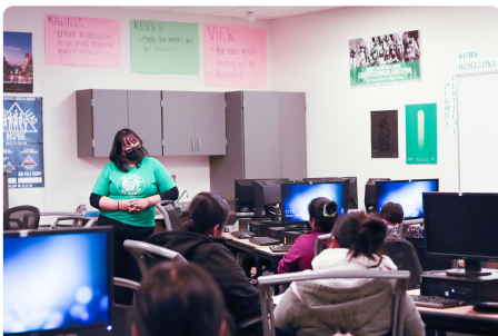
Parents discuss attendance during breakout sessions