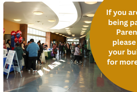
Families visit the resource fair

If you are interested in being part of our next Parent Academy, please reach out to your building liaisons for more information.