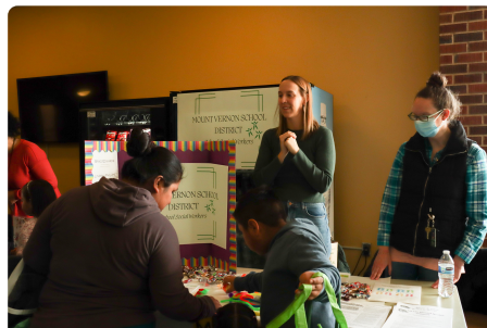
MVSD Special Services team members connect with families