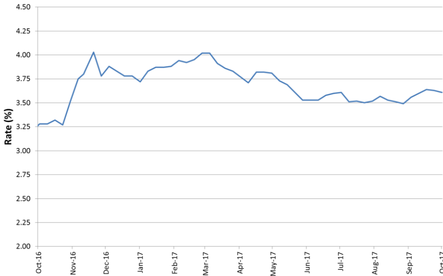
Bond Buyer Index 20-Year General Obligation Bonds 1 Year History