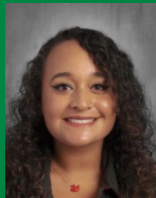
Mount Vernon High School